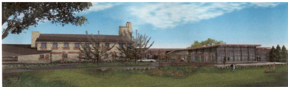
WEST FACING - ENTRY SIDE RENDERING

Both of these planning cases will be reviewed at the Monday, June 1 st meeting of the City Council. Questions concerning these two projects may be directed to the Planning Department at 952-448-9200.