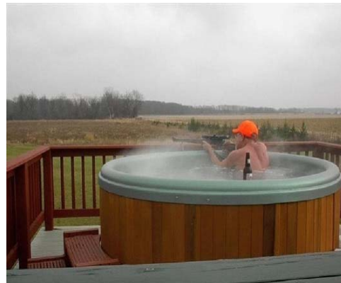
The lazy man's way to hunt.

"Yeah, but we're getting farther from the truck," the other added.