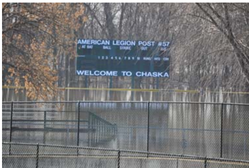
Water at Athletic Park on 03-21-10

With the flood waters quickly receding, Athletic Park has now reached a point where most of the water is off the playing field and parking area. City crews are now able to begin clean up. On a positive note, it appears that the grass and infield made it through the flood waters, as the grass was still dormant. The grass has now started to grow. This should help shorten the time needed to get Athletic Park back in shape.