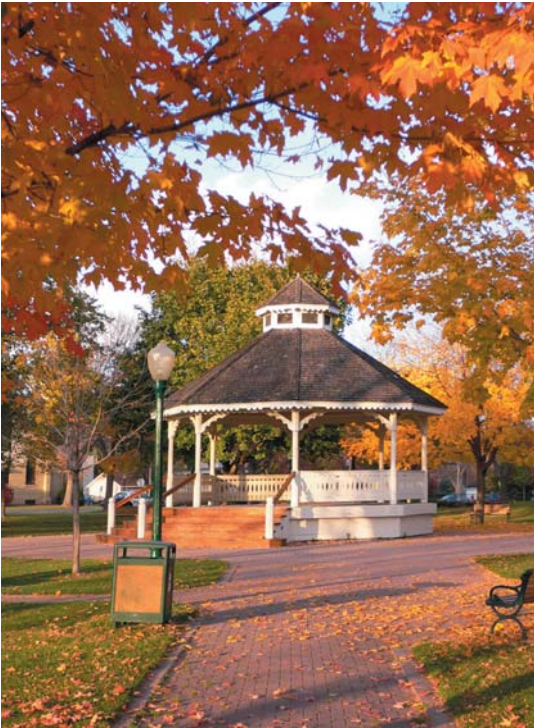
Gazebo in Chaska's City Square Park

The City of Chaska is proud of its past, and very cognizant of the role its history can play in future development. With the creation of a set of specific historic contexts, the city takes the next important step of tying preservation to planning, ensuring a vibrant future for the community by building on the resources of its past. Historic contexts will allow the city to evaluate its resources and incorporate them in the comprehensive planning process, while securing the character and spirit inherent in Chaska's history.