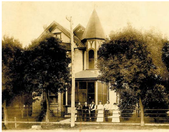
Turn-of-the-century photograph of the Frederick E. DuToit House at 121 Hickory Street

Each context is arranged around a short narrative, which is not designed to be a full history of the city, but rather serves as a brief introduction to the theme. In many cases, some time is spent on descriptions of the past and on lost resources; these narratives are designed to fill in information that would be missing if only current resources were considered, and to demonstrate the importance of remaining properties. The next component is a fairly comprehensive list of typical property types associated with the context; this section also identifies some specific Chaska sites. Visual examples round out the individual sections.