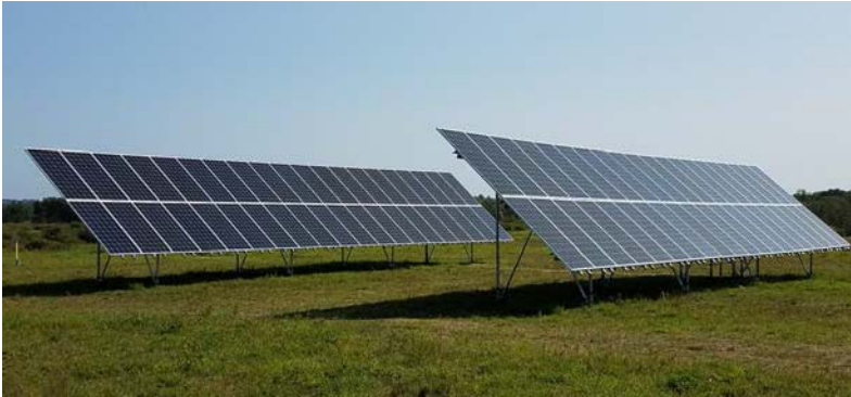
Detroit Lakes Public Utility's 29.3 kW Select Solar Community Solar Garden Detroit Lakes, MN