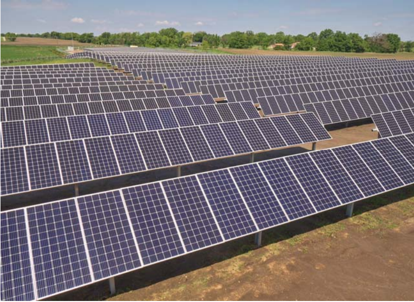
Minnesota Municipal Power Agency's 7 MW Buffalo Solar Buffalo, MN